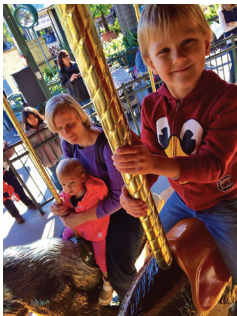
Enjoying the merry-go-round.

Nothing is more delightful than sharing in a small child's discovery of the world. Every new toy, each leaf and stone, every bird or butterfly is a fresh surprise. To a toddler, furniture seems made for climbing and bouncing. Drawers and cupboards are meant to be opened. Every object cries out to be touched, prodded, tasted and, given the time and opportunity, taken apart. The possibilities are truly wondrous.