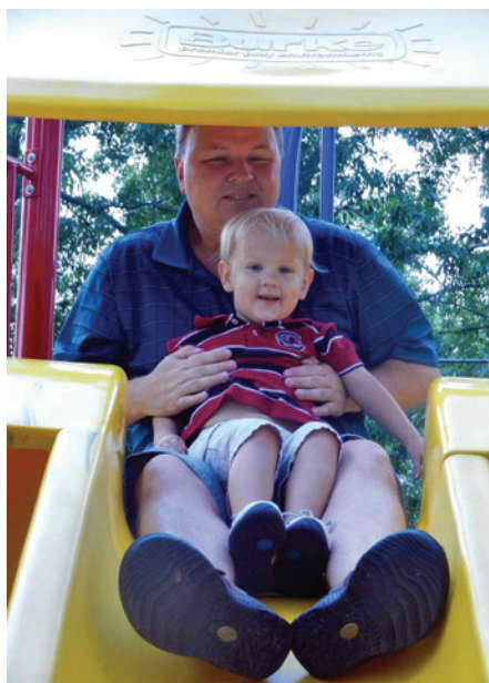
A father and his son have fun on the slide

Taking small children to a park or playground presents some special challenges. Since we can't observe our toddlers from a distance, we stay close by to monitor their activities. Often we climb on playground equipment with our toddlers and preschoolers. In this way we know what they are doing and can keep them safe. In addition, we can teach them climbing and other skills.