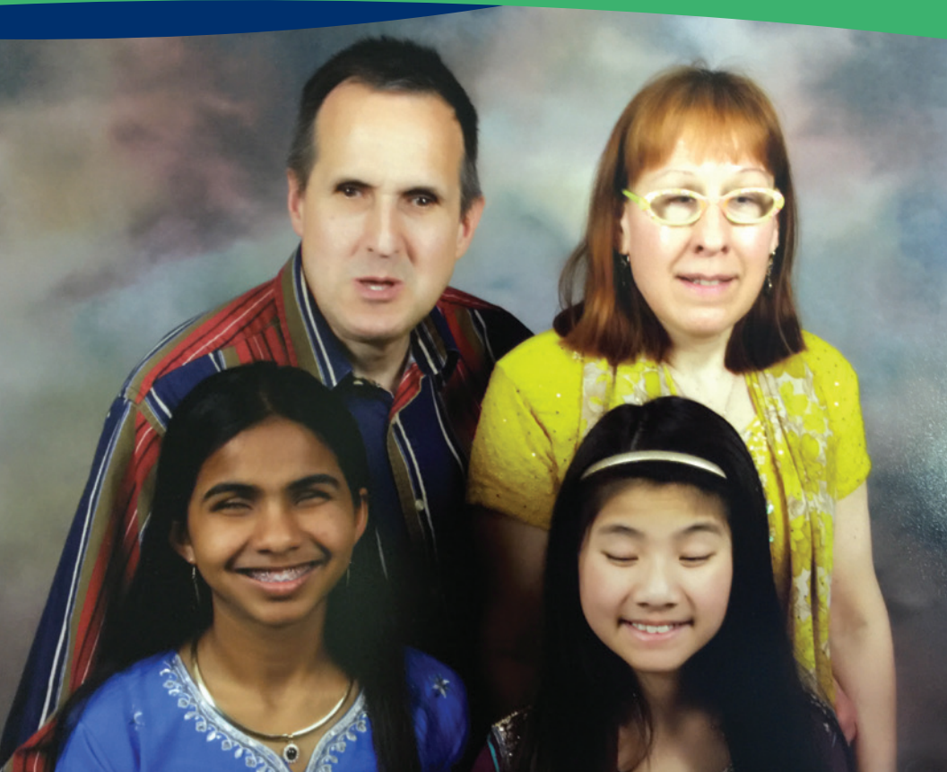
A portrait of the Sprecher family of Chicago.