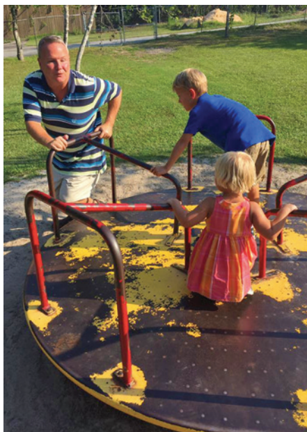
A blind dad spins his kids on the merry-go-round at the playground.

with the wellbeing of children and families. Our experience has taught us that blind parents are scrutinized far more closely and judged to be unfit more frequently than sighted parents under similar circumstances. Interventions often occur not because of documented problems, but because caseworkers and judges fear that problems may arise in the future. Federation leaders estimate that as many as one in four households in which the parents are blind