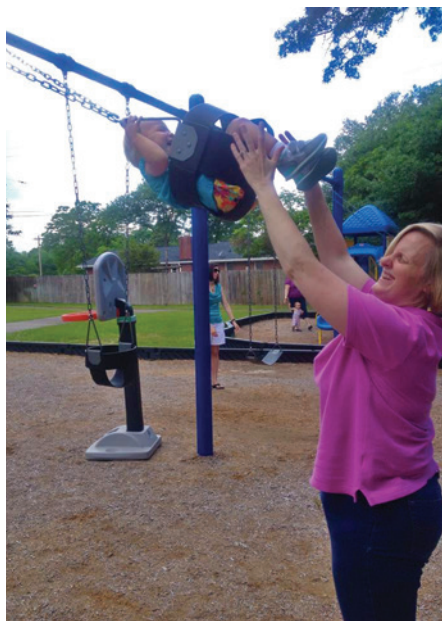
Fun on the swings.

have been visited by workers from child protection services. Furthermore, blindness has often been argued as a ground for terminating parental rights in custody cases. We believe that these interventions and decisions stem from a lack of understanding of blindness.