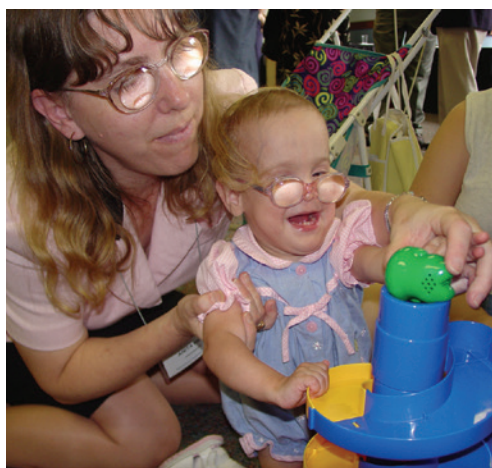
Learning through play.

A number of blind mothers and fathers have contributed their